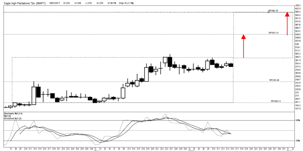
Kinerja harian saham BWPT

Danareksa research report are also available at Reuters Mulfex and First Call Direct and Bloomberg